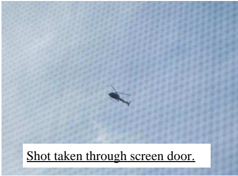
Shot taken through screen door.