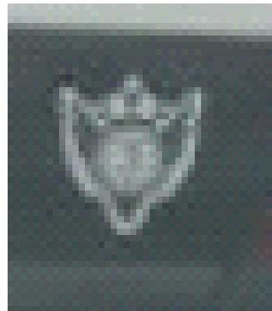
Enlarged emblem on back right of car.